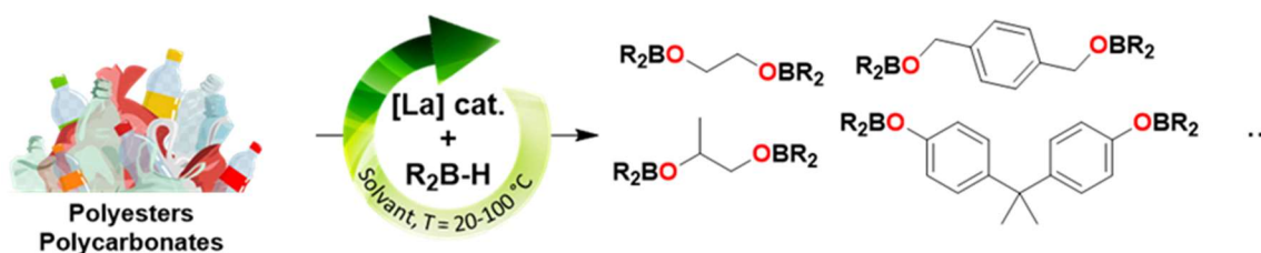
Figure 2. Our catalytic system for the reductive depolymerization of polyesters and polycarbonates

Inspired by the work of T. J. Marks et al. ,[5] on the reduction of esters, we considered the trisamide complex La[N(SiMe_3)_2]_3 as a 4f-catalyst and the pinalcolborane as a hydride donor, for the reductive depolymerization of a wide range of polyesters and polycarbonates.[6]