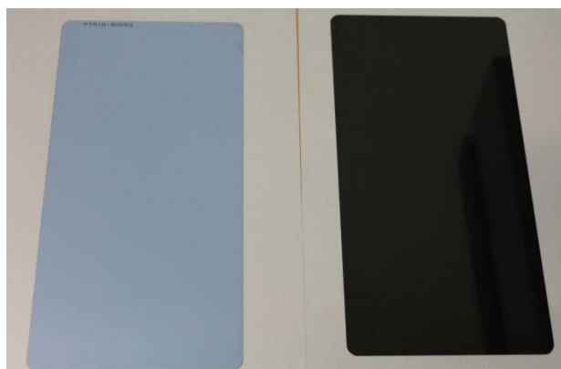
Figure 1 : Phosphor screen used in the study; left: sensitive side, right: back side; type: TR, commercialized by Perkin Elmer; size: 12.5 x 25 cm 2

Since the beginning of the researches on DA technique two main applications have been developed: - the radiological mapping in nuclear facilities under dismantling – and the studies of particular samples. In facilities to be characterized, Digital Autoradiography was chosen as a promising technique to analyze in situ tritium and other radionuclides. By using reusable screens (Figure 1), it was possible after data processing and Kartotrak software use, to obtain reliable two dimensional mappings of radioactivity traces for several 200 m 2 laboratories.