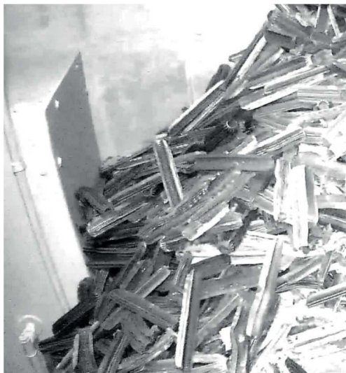
Figure 1: Pieces of Magnesium cladding stored in CEA Marcoule

The reprocessing of spent fuels from UNGG (Uranium Natural Graphite Gas) nuclear reactors in France has generated cladding wastes mainly made of Mg alloys [1] (Figure 1). The waste will be conditioned in a waste-package, ensuring durability, handling capability, and confinement of the radionuclides during further storage period and final disposal [2]. The embedding and conditioning of magnesium waste are based on their immobilization in a hydraulic binder (Figure 2). Several binders were tested: OPC, cement with blast furnace slag, cement with fly ash, geopolymer, etc. In any case, they imply that the waste will be exposed to a very basic environment ( \text{pH} > 12 ). Corrosion of magnesium could have consequences on the structural integrity of a cemented long-term package, due to the expansive corrosion products that form and cause stress within the coating matrix. In addition, corrosion leads to \text{H}_2 production, which has to be taken into account to ensure the safety of the storage of conditioned waste packages.