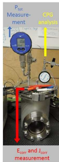
Figure 3: Electrochemical-gas measurement coupled reactor